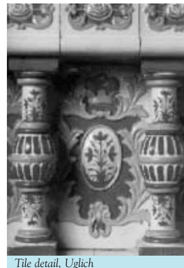
Tile detail, Uglich

During our morning cruise on the Volga River attend a lecture on the "Golden Ring" cities which surround