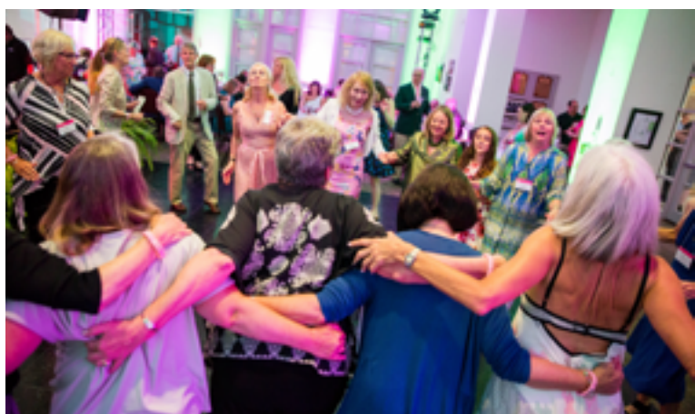
Come back for the annual all-class Reunion!