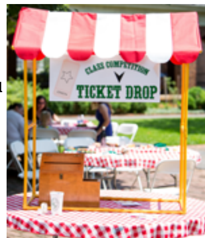
The Alumnae Alliance spearheaded an Engagement Festival at Reunion 2016, which offered alumnae the opportunity to learn about the working groups and ongoing projects.

As part of reopening the school as of July 2, 2015 after the "recent unpleasantness," the Alumnae Alliance, with a proposed structure of seven Working Groups coordinated by the Alumnae Alliance Council, was conceived by the Sweet Briar College Board of Directors in late August 2015 "to promote programs and services that connect alumnae to the College and to each other to sustain Sweet Briar in perpetuity." The Alumnae Alliance and its governing Council began formal operations as of October 5, 2015. During this first year, the Alumnae Alliance Council has guided the Alumnae Alliance to determine its core values, guiding principles, and approach for volunteers conducting operations with appropriate oversight from the College, in accordance with Principles of Accreditation from the Southern Association of Colleges and Schools Commission on Colleges (SACS).