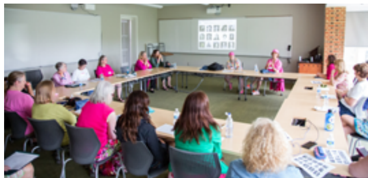
Alumnae joined the Alumnae Alliance Council for discussion and questions during the Alumnae College session at Reunion.

TRANSFORMATIONAL CHANGE. Recognizing that the College is re-building infrastructure and operational collaboration among offices and departments on campus, and rebuilding trust with its stakeholders, alumnae can embrace and support the necessary changes. Through working with the College to take a thoughtful and deliberate approach balanced with a sense of urgency, the Alumnae Alliance will help the College with smartly transforming itself into a vibrant, healthy and sustainable College community.